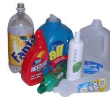
Plastic bottles and containers labeled with numbers 1, 2, 3, 4, 5 & 7 Plastic Bags are also acceptable