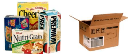
Cardboard & Cereal Boxes