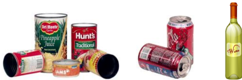
Tin, Metal Cans & Aluminum Cans, Glass (all colors)