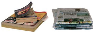
Paper, Newspaper, Magazines, Telephone Books & Junk Mail